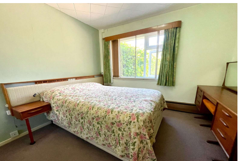
Two Bedroom Semi-Detached Bungalow