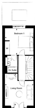
Hartland Village, Hartland Mews - The Almond, Property 3, First Floor